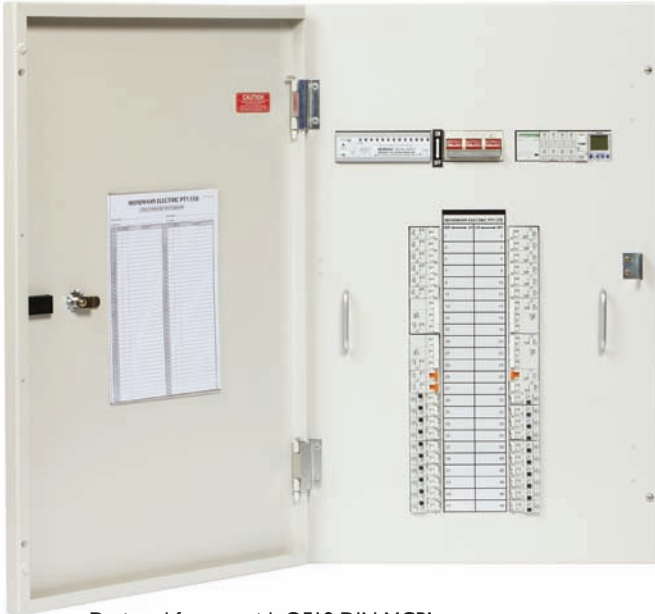
Designed for use with QF18 DIN MCB's & QF10 DIN RCBO's

Introducing the HEINELEC Eclipse Range of distribution switchboards. The new Eclipse Range offers a durable and robust product, designed for optimum field versatility coupled with time saving installation features. The Eclipse Range of distribution switchboards are designed for light commercial/light industrial applications, with no compromise in quality and available at an affordable price.